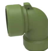
KP 90 Backshell Flex Tube