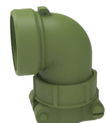
KP 90 Backshell Cable Clamp

For more details and full ordering information see the ITT Cannon CA B and KP Catalog.