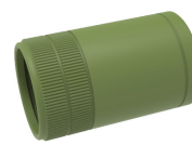
KP PG/ME Adapter