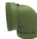
CA 90 Backshell Flex Tube