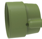
CA Short Adapter