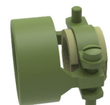
KP Cable Clamp