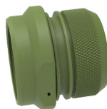
KP Shielded Backshell