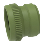
KP Flex Tube Adapter