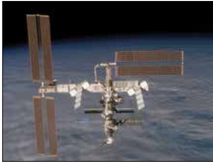
Space & Satellites

Invented by Cannon engineers in 1952 for aircraft radio systems, the D-Subminiature was designed as a smaller, lightweight rectangular alternative to larger, heavier connectors of the time. Today, Cannon continues its legacy of innovation through highly engineered D-Sub connector styles, sizes, configurations and accessories. From rocket launchers and telecommunications, to avionics and high-speed rail, its performance, reliability and versatility have made this Cannon invention one of the most widely used connectors in the world.