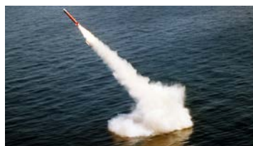
MISSILES &amp; ORDNANCE