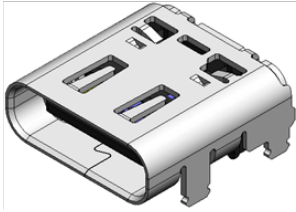
On-Board Receptacle (DX07S024JAA)