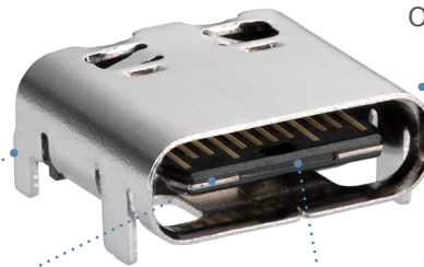
USB4 Type-C Receptacle, Top-Mount, 24 Circuit (105450 Series)

Provides space savings and design flexibility