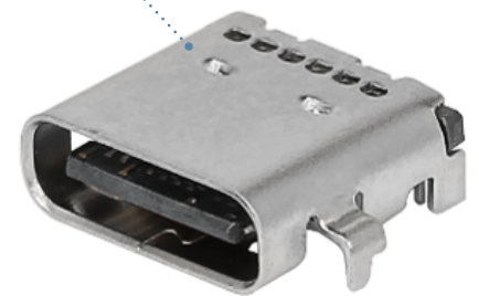
USB 3.2 Type-C Receptacle, Mid-Mount, 24 Circuit (217184 Series)