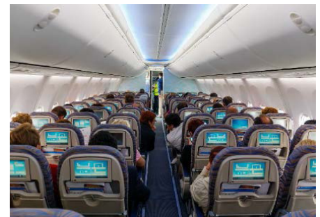
In-Flight Entertainment Systems