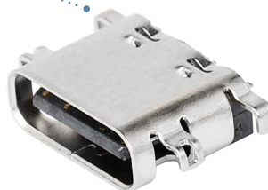
USB 2.0 Type-C Receptacle, Mid-Mount, 16 Circuit (216990 Series)