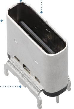
USB4 Type-C Receptacle, Vertical, 24 Circuit (204711 Series)