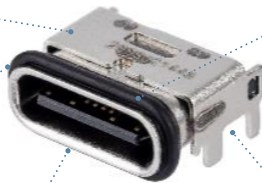
USB 2.0 Type-C Receptacle, 16 Circuit (213083 Series)

Provides protection against dust and water ingress