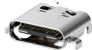
USB4 Type-C Receptacle, Mid-Mount, 24 Circuit (105455 Series)