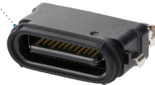
USB 3.2 Type-C Receptacle, 24 Circuit (202410 Series)