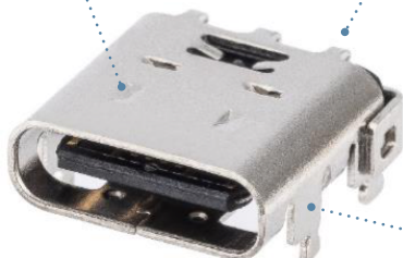
USB 2.0 Type-C Receptacle, Top-Mount, 16 Circuit (213716 Series)

Metal shell Provides strength/robustness to the connector