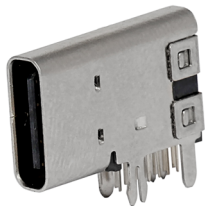
USB Type-C Receptacle, Upright, 14 Circuit (216989 Series)