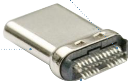
USB4 Type-C plug, 24 Circuit (105444 Series)