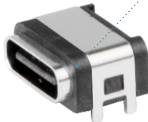
USB Type-C Receptacle, 6 Circuit (217176 Series)

Provides protection against dust and water ingress