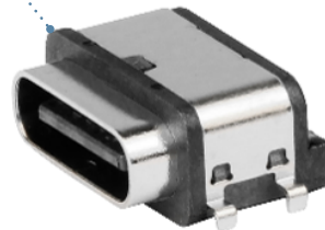
USB Type-C Receptacle, 6 Circuit (217177 Series)