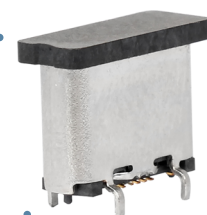
USB 2.0 Type-C Receptacle, Vertical, 16 Circuit (217182 Series)