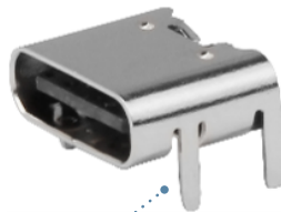
USB Type-C Receptacle, Top-Mount, 6 Circuit (217175 Series)

Long receptacle housing leads Is suitable for different PCB thicknesses to provide stable PCB connections