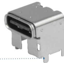
USB 2.0 Type-C Receptacle, Top-Mount, High-Center, 16 Circuit (217180 Series)

Is helpful in aligning high-center line positions