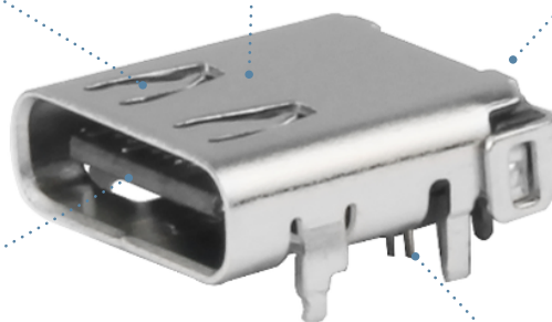
USB 3.2 Type-C Receptacle, Top-Mount, 24 Circuit (217183 Series)

Top-mount and mid-mount USB 3.2 type-c receptacles Offer design flexibility