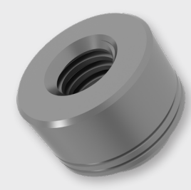
PCB Mounting Fasteners