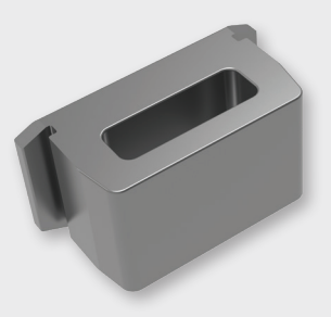
Cable-Tie Mounts and Hooks