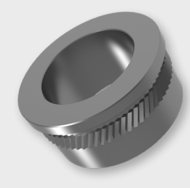
SI® Compression Limiters